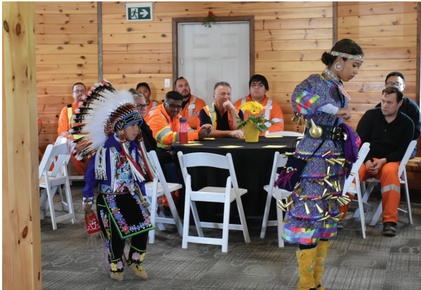
New Gold hosted an Indigenous Peoples' Day celebration at the Roundhouse featuring a local drum group, a jingle dress dancer, a woodland dancer, as well as a teaching from a Knowledge Keeper on the history of Treaty 3 followed by a lunch.