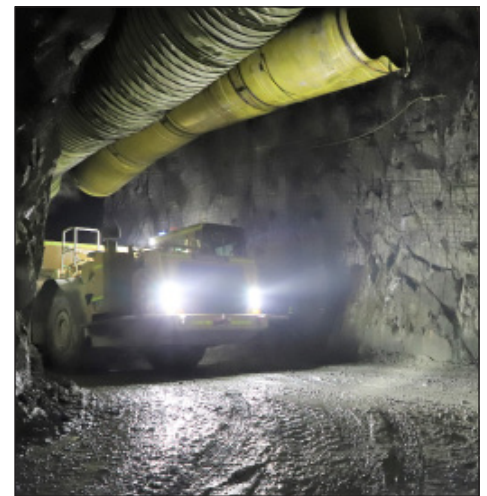
An earthmover operating in the Intrepid underground component.