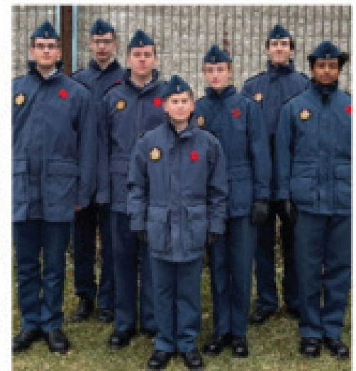
Air Cadet Squadron en route to Remembrance Day services with transportation support from New Gold.