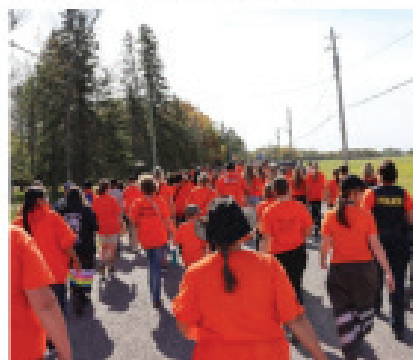
Annual Truth and Reconciliation Walk.