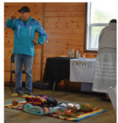
Fall Ceremony at the Roundhouse on Rainy River mine site.