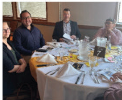
Fort Frances Chamber of Commerce Business Awards.