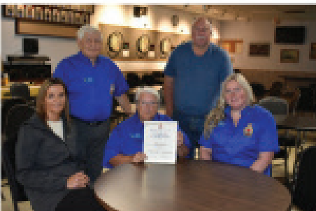
Royal Canadian Legion Branch #29 received funding for the purchase of new chairs.