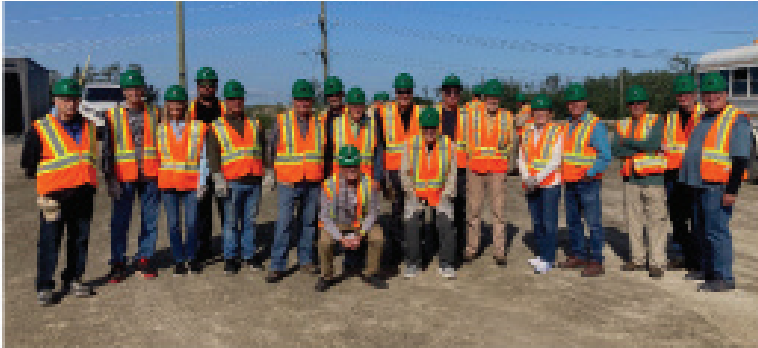
Sioux Narrows Nestor Falls Men's Group mine tour.