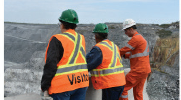
Annual neighbours tour of the mine.