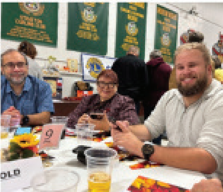
West Rainy River District Lion's Club Hunter's Dinner.