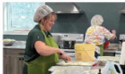
New Gold partnered with the Grand Finale Senior Centre and Knox United Church for the annual Christmas Take-Out Dinner